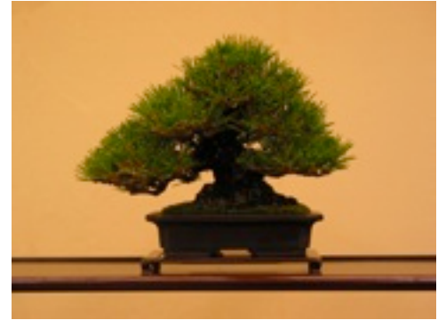
Informal Upright Black Pine

Here are a few photos of black pine I saw in Japan.