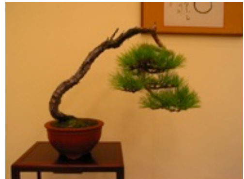
Literati Black Pine