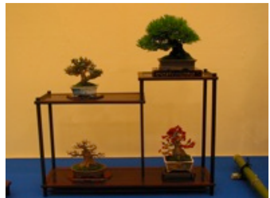
Black pine in shohin display